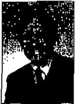
Bruce Stanton Member of Parliament Député Simcoe North/Nord

Room 702 Justice Building Ottawa ON K1A 0A6 Tel: 613-992-6582 Fax: 613-996-3128